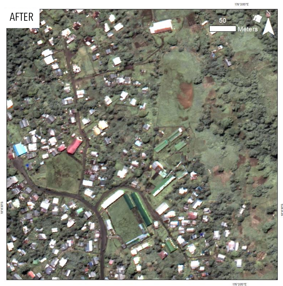
Worldview03 / 8 APRIL 2020