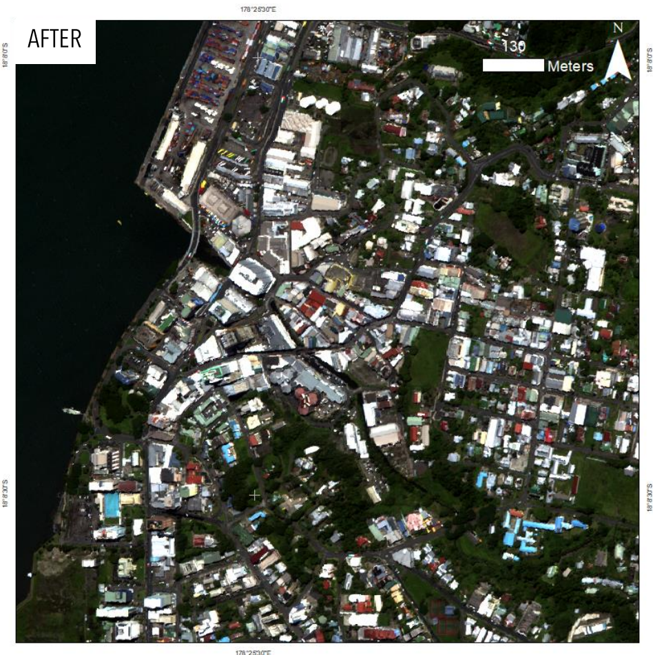
Worldview03 / 8 APRIL 2020