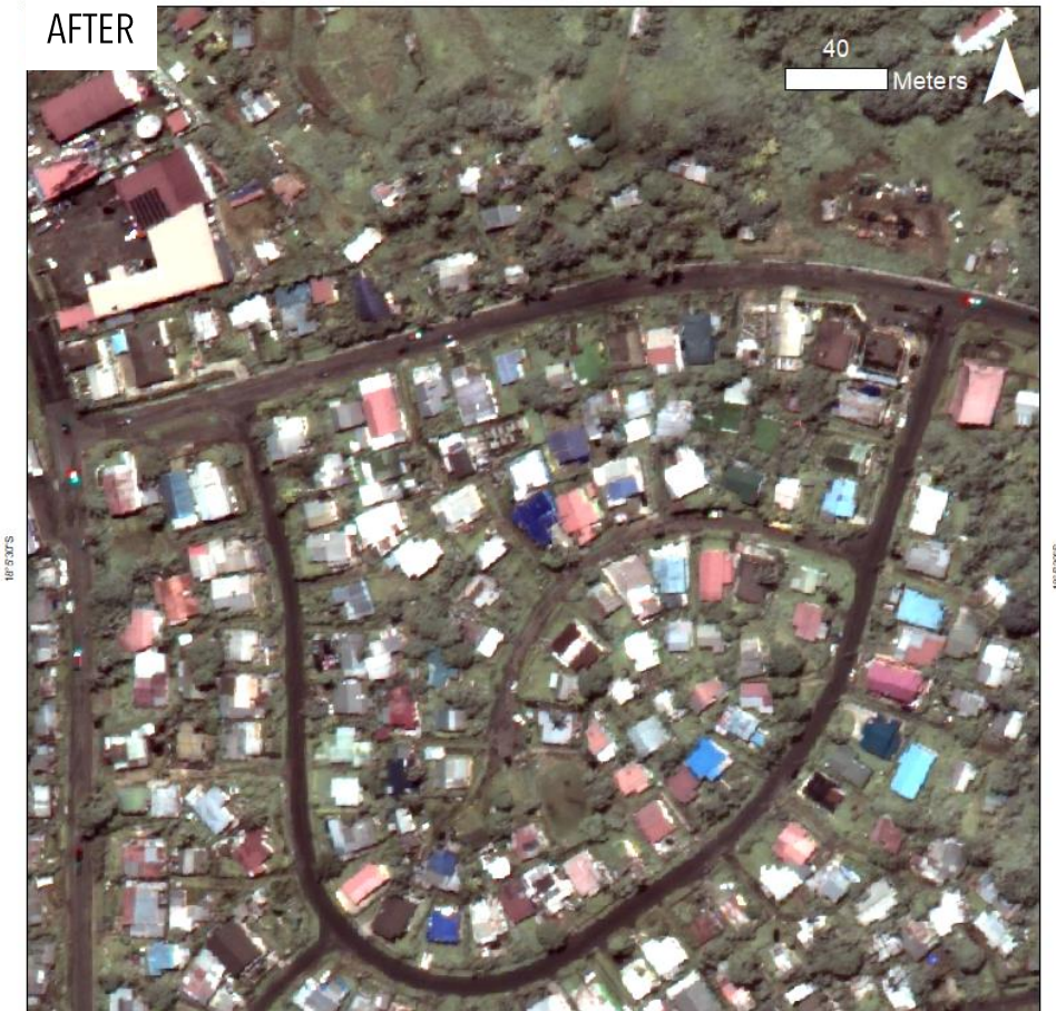
Worldview03 / 8 APRIL 2020