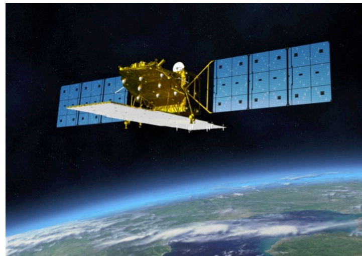
Left: Advanced Land Observing Satellite-2 (ALOS-2) Right: H-IIA Launch Vehicle No. 24 (H-IIA F24) with the Advanced Land Observing Satellite-2 (ALOS-2)