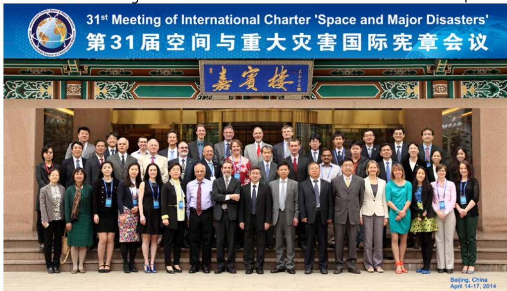
Charter Board & Executive Secretariat members in Beijing, China on 16 April 2014.

CNSA will be leading the Charter for six months until mid-October 2014.