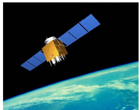
China's first high-resolution earth observation satellite, GF-1.

The satellite carries two kinds of payload, including 2m panchromatic & 8m multispectral camera and 16m multispectral camera. The satellite is providing high precision earth observation data, which will be widely used in the dynamic remote sensing monitoring of land use,