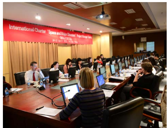
The International Charter Project Manager Training was hosted at CRESDA, in Beijing, China from 10 to 11 April 2014.

China National Space Administration (CNSA) hosted a Project Manager (PM) training course on the International Charter 'Space and Major Disasters' at the China Centre for Resources Satellite Data and Application (CRESDA) from 10 to 11 April 2014.