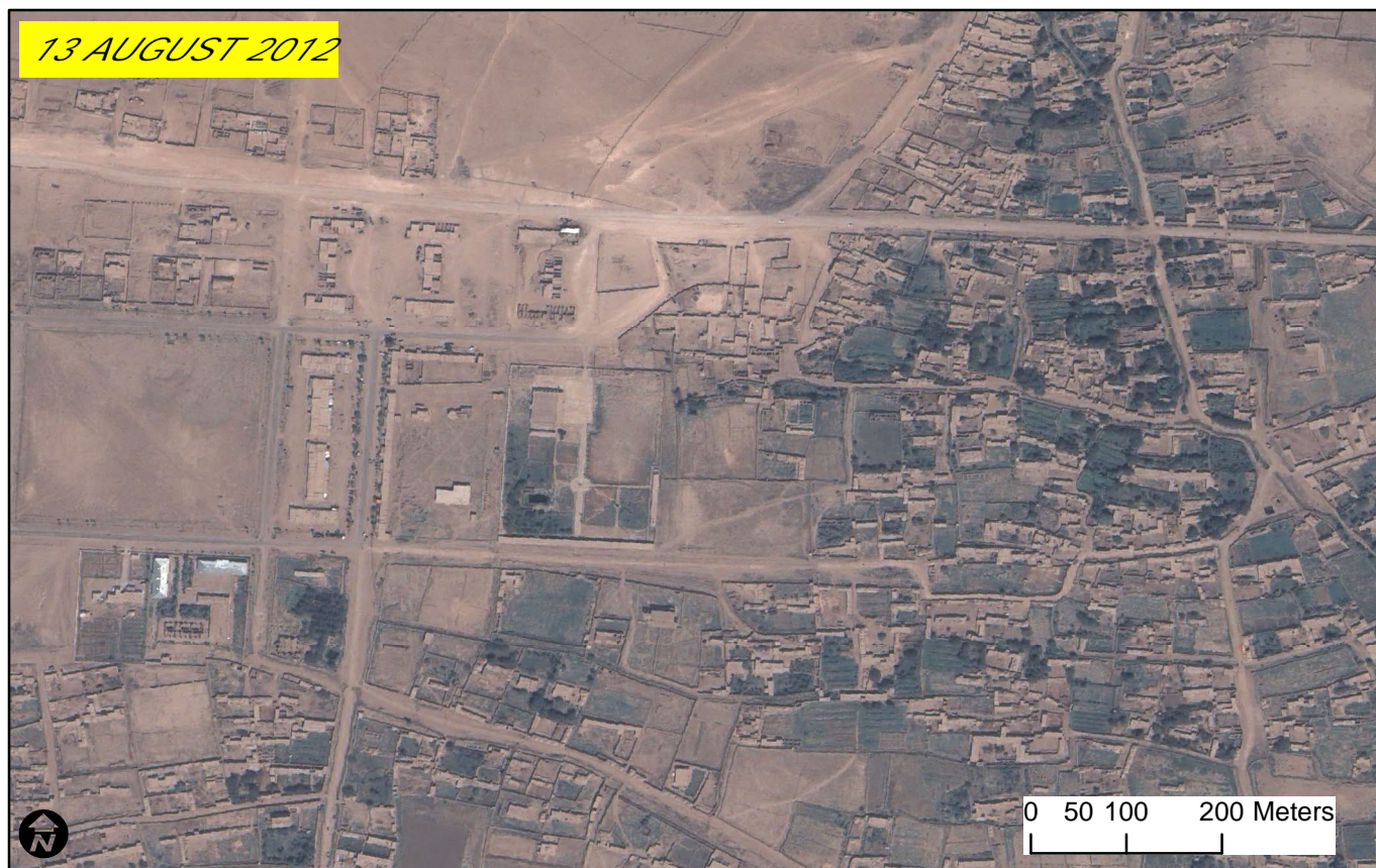
Figure 1: Kwanjanduko Flood Waters and IDP Settlement