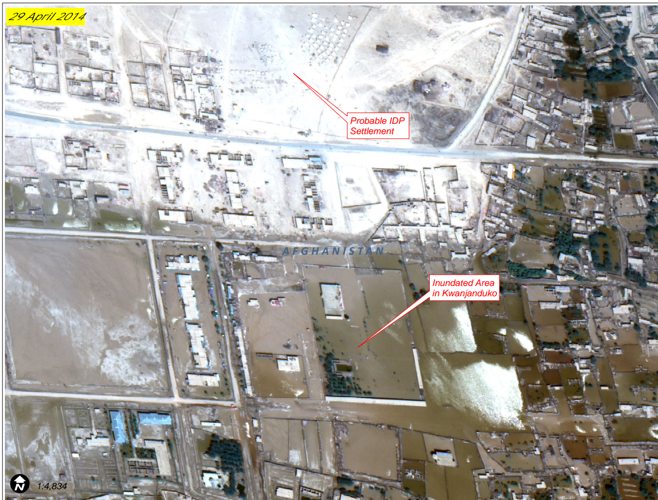
This image shows the center area of Kwanjanduko (Khvajeh do Kuh) inundated by flood waters as of 29 April 2014 (see Figure 1 for comparison image). A probable IDP settlement is also visible to the north.

Analysis using imagery collected 29 April 2014